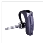
BT Wireless earpiece