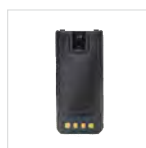
Li-polymer battery 2400mAh