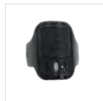
BT Wireless ring PTT