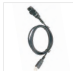
Programming cable (USB port)